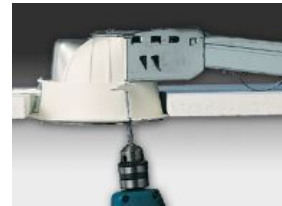
Easy installation of CASA.